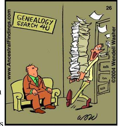
Good news, Mr. Smith!...

Tip for November 2016.....ALWAYS, ALWAYS! Post a valid source every time you enter something into your genealogy database! Yes, it takes a lot of time to do this, but it would have been so helpful if I had done this years ago!