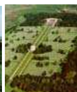
Normandy American Cemetery, Colleville-sur-Mer, France