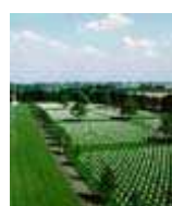
Netherlands American Cemetery, Netherlands