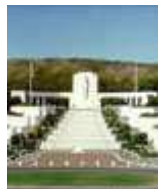
Honolulu Memorial, Honolulu, Hawaii