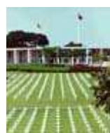
Manila American Cemetery, Fort Bonifacio, Manila, Philippines