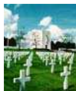
Lorraine American Cemetery, France