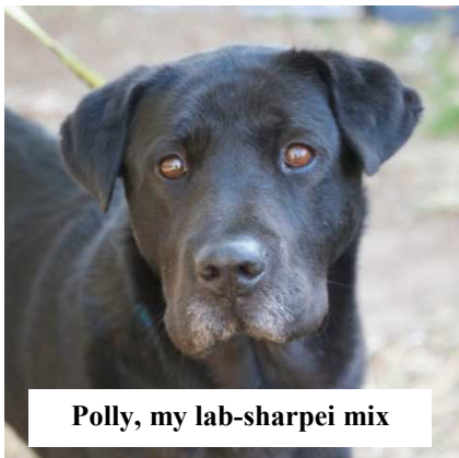
Polly, my lab-sharpei mix