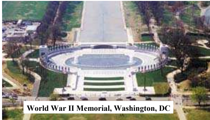
World War II Memorial, Washington, DC

There are not many left in this year of 2016. We thought it good to remember what they GAVE for our country.