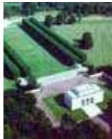
Epinal American Cemetery, Epinal Vosges), France