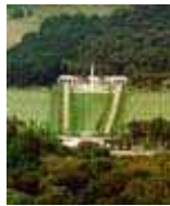
American Cemetery, Italy