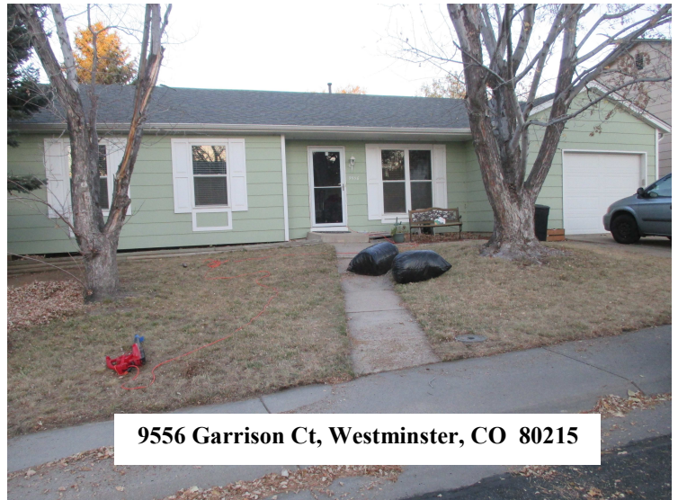
9556 Garrison Ct, Westminster, CO 80215

The fact that Polly was able to unlatch the gate, (something I found it very difficult to do) meant that the first