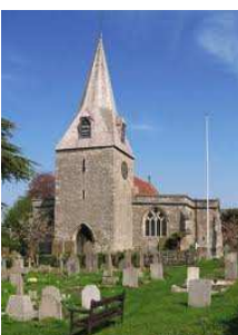
East Farleigh-St. Mary-Churchyard