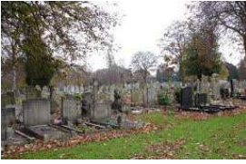
Birmingham Yardley Cemetery