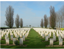
Warlincourt Halte British Cemetery, Saulty