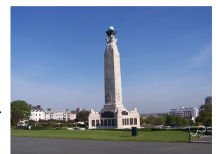
Plymouth Naval Memorial