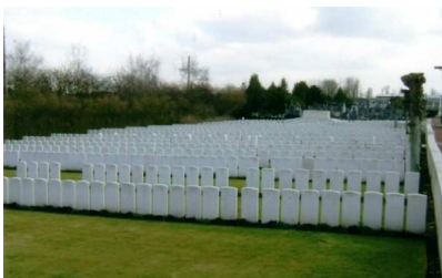
Lillers Communal Cemetery

A. W. Dodge Driver 49041 03/05/1915 Unknown Royal Field Artillery United Kingdom III. A. 28. LILLERS COMMUNAL CEMETERY