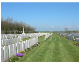
Terlincthun British Cemetery, Wimille