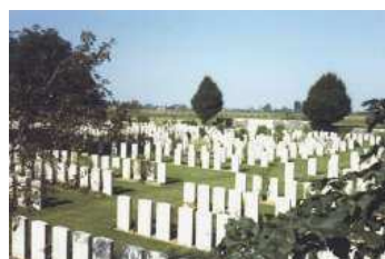
Ration Farm Military Cemetery La Chapelle-D-Armentieres

A. W. Dodge Driver 49041 03/05/1915 Unknown Royal Field Artillery United Kingdom III. A. 28. LILLERS COMMUNAL CEMETERY