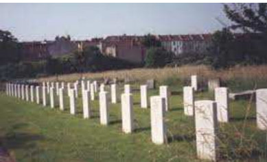
Bristol Arnos Vale Cemetery