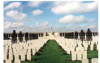
Pozieres British Memorial Somme France