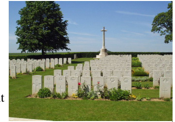
Houchin British Cemetery