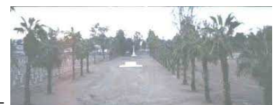
Bagdad (North Gate) War Cemetery