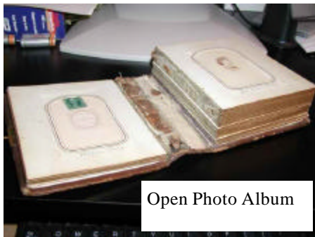
Open Photo Album